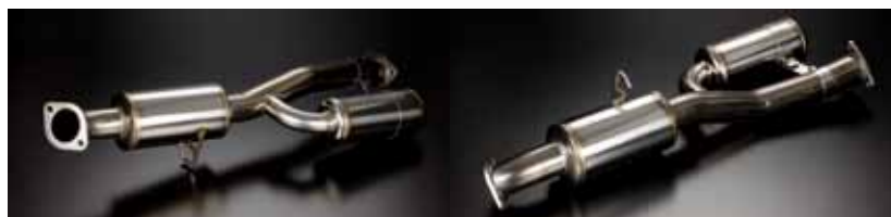
Muffler Front pipe equipped Resonator 18000-AP1-702-F

S2000 Catalyst Adapter pipe 60mm to 70mm